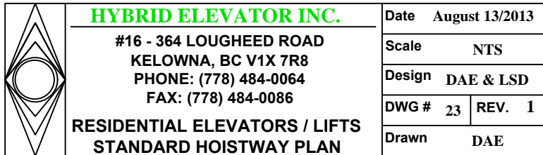
TYPE # 4 RIGHT HAND DRIVE WALL 3' x 5' CAR